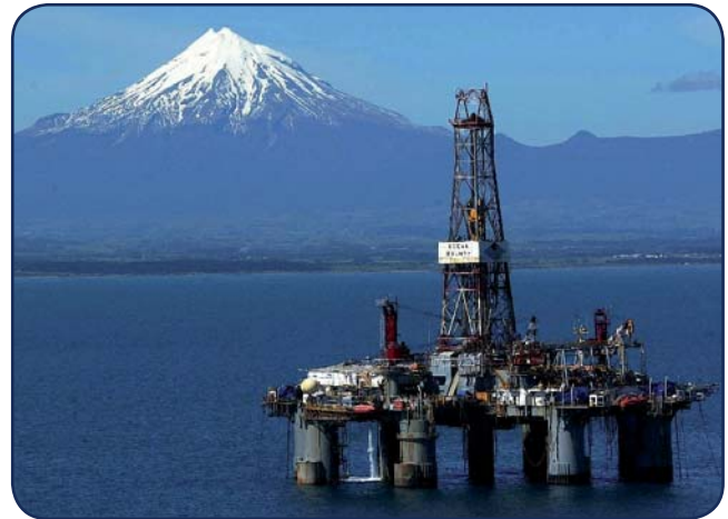
Offshore drilling, Taranaki Basin, New Zealand

AWT's independent tendering process draws on an extensive range and in-depth knowledge of recognised vendors to ensure our clients receive fit-for-purpose drill rig leases and associated third-party services within budgetary parameters.