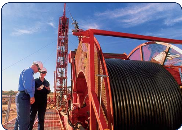
Innovative coiled tubing drilling, Cooper Basin, South Australia

AWT is currently pioneering execution of an underbalanced coiled tubing drilling program for Western Australia's first gas storage project.