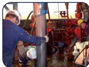
Onshore drilling Perth Basin, Australia